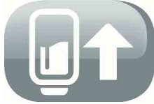
Removable fuel tank