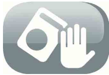
Automatic tip-over switch