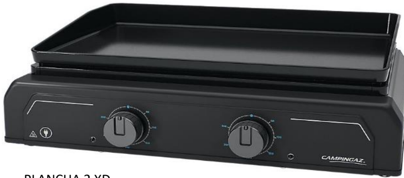
PLANCHA 2 XD