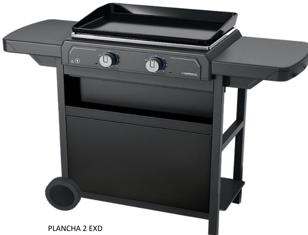
PLANCHA 2 EXD