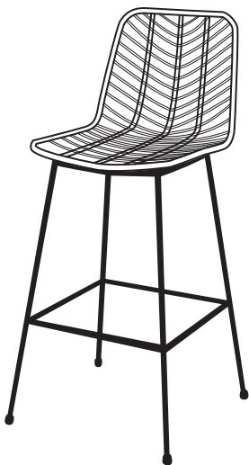
1 X Chair